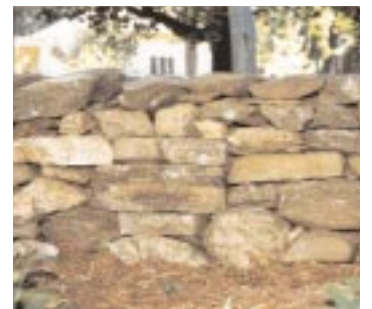
Clear away brush and debris, and place stones tightly together.

Stone walls that are not well maintained provide shelter for mice and small mammals that carry deer ticks. Seal stone walls or place rocks together tightly to reduce habitat for small mammals. Clear away brush, leaf litter, fallen trees and rocks each year.