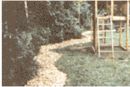
Reduce tick numbers on your property by making simple landscape modifications.